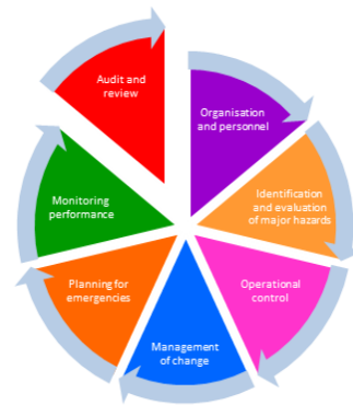
Fig. 1 Internal audit procedures play an important role in the safety management system

It should be noted that the term 'auditing' involves fundamental assessment of the validity and reliability of the safety management system itself. It should not be confused with some operator's use of the term "auditing" to refer to activities such as safety