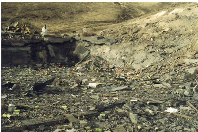
Figures 2 and 3: Booster Room 2 before and after the explosion